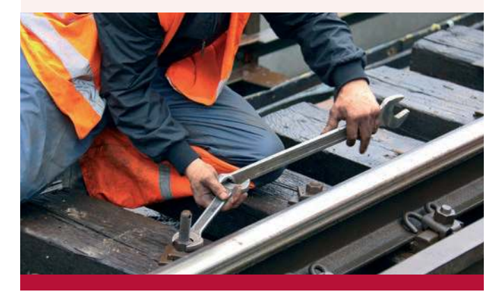
\rightarrow See more information at www.ganymedesolutions.co.uk